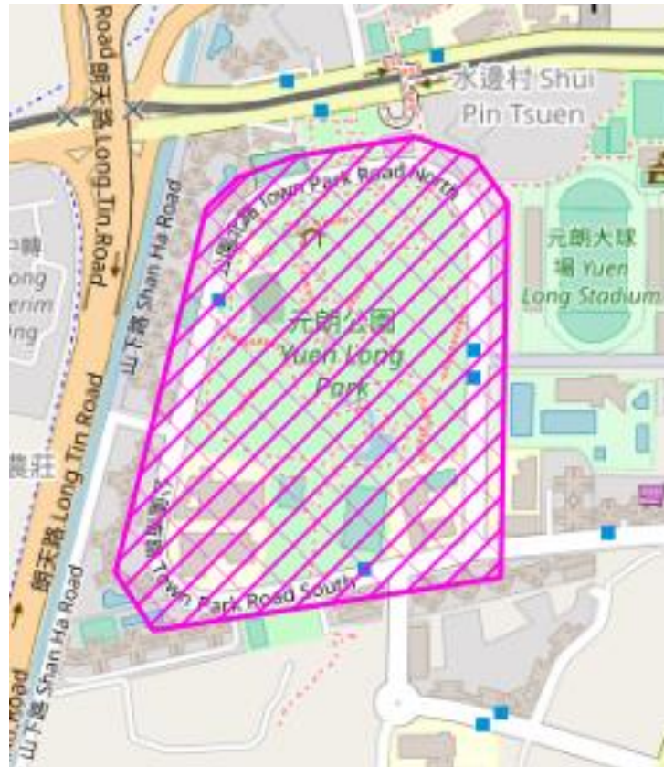
Map A. Embargoed area 圖 A. 封場範圍